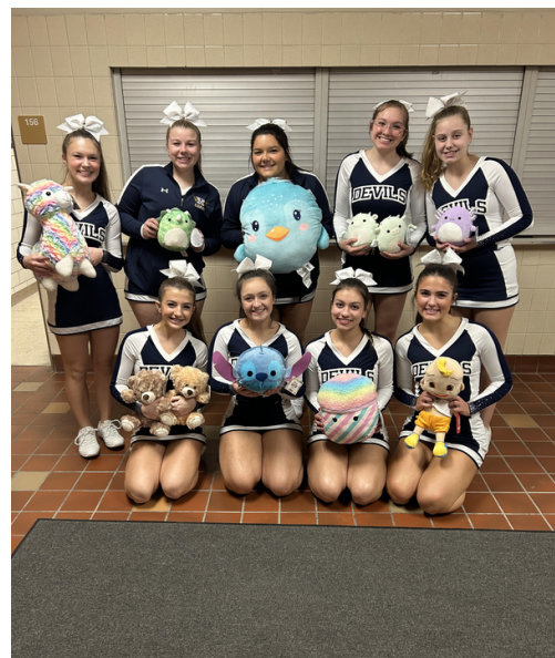
Cheerleaders pose with stuffed animals for the Akron Children's stuffed animal drive held by the McDonald Cheer Program

MHS Sports - Page 1 MHS Sports, Winter Driving - Page 2 Winter Driving, Students Get Involved- Page 3 Editorial, Outstanding Staff - Page 4 Outstanding Staff, Music Review - Page 5 People on the Street! - Page 6 Top 10 List, Movie Review - Page 7 Back Page Pics - Page 8