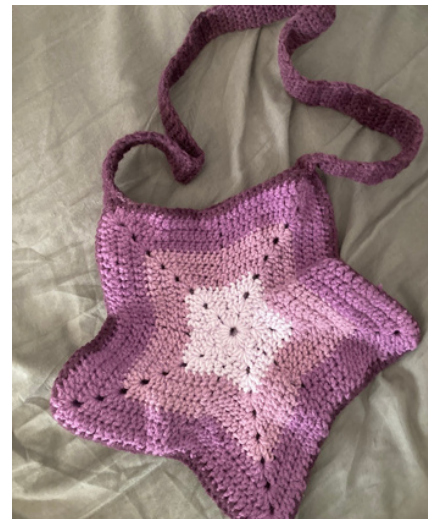
A purple star bag that I made for myself

Sometimes we just don't have the time to make art since we are so busy with school, extracurriculars, friends, and family. Winter break would be a great time to make some kind of art as you won't have to worry about school work. For example, during my Thanksgiving break, I started making a sweater for the winter holidays as I had so much time on my hands. You could even do something small, like make some Christmas gifts for your friends and family or even just try something new.